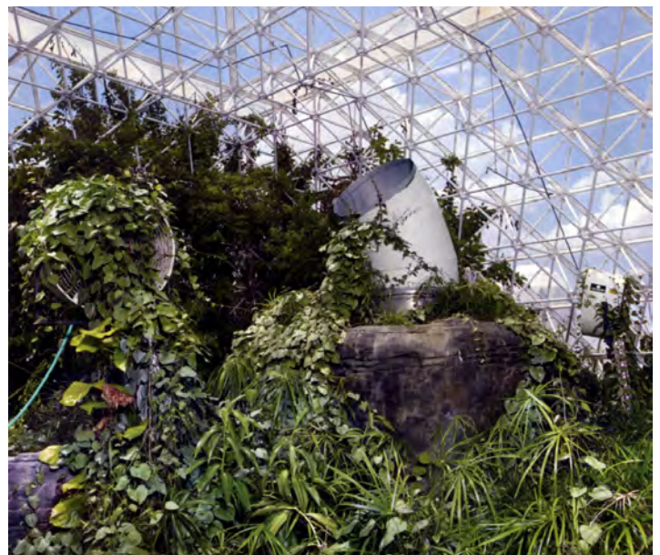
Biosphere 2’s 91-foot-tall rain forest contains more than 150 plant species and now provides scientists a test ground for ecosystem experiments.

The story of fresh-faced idealists getting taken down a notch played well in the media. For two years the glass walls of Biosphere 2 were lined with TV cameras and tourists. The crew’s lives turned into reality TV. In fact, the producers of the world’s first reality TV show, Big Brother , which aired in the Netherlands in 1999, acknowledged Biosphere 2 as their inspiration. True to reality TV’s typical plotline, months cooped up together while struggling with their atmosphere and hunger and being filmed by well-fed people led to squabbles among the Biospherians. They emerged from the air lock in September 1993 in two groups of four who weren’t speaking. Organizational cracks opened between them and their advisory scientists and extended into their relationship with Ed Bass. Originally budgeted at $30 million, Biosphere 2 had already cost a reported $200 million. By the time a second crew took its place inside, Bass had had enough. On April 1, 1994, his bankers, accompanied by carloads of armed federal marshals and sheriff’s deputies, swept into the site with a restraining order. The second