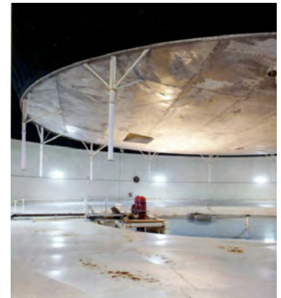
The "south lung" is one of the two rooms that allowed Biosphere 2 to breathe—and not explode—during its former life as a closed structure.