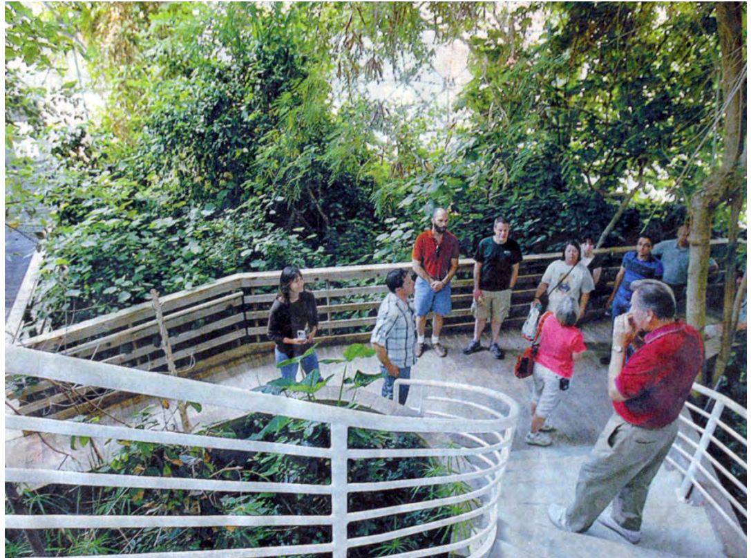
Tour guide Bill Young talks to a group visiting the orchard area of Biosphere 2. Tours are smaller and more intimate during the summer.

It's cooler than Tucson and because it's less busy than in other seasons, it presents an opportunity