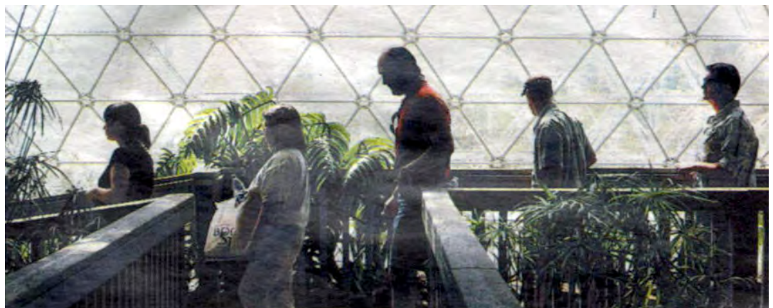
People touring the facility walk along the ocean savanna corridor.